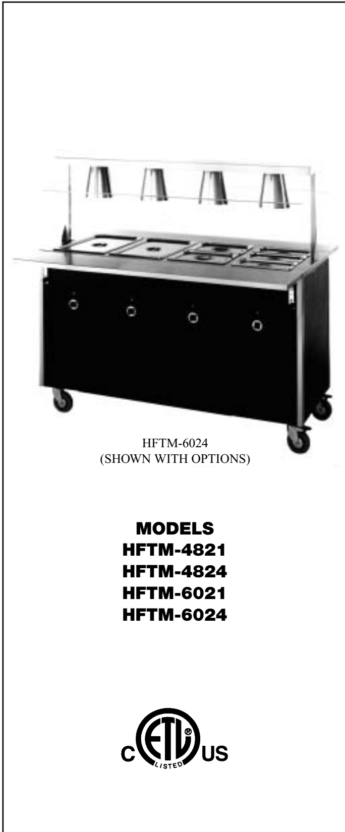
HFTM-6024 (SHOWN WITH OPTIONS)

MODELS HFTM-4821 HFTM-4824 HFTM-6021 HFTM-6024